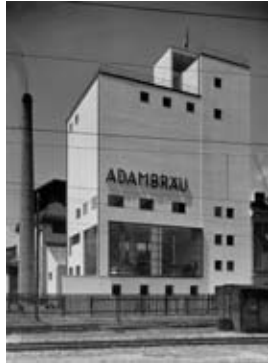
adambrau_um1930.jpg Brewhouse of the Adambrau brewery, round 1930

The photos may be reprinted free of charge only in the context of the reporting on the aut and with the specified photo credits.