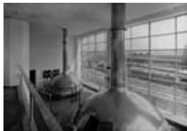
brauraum_um1930.jpg Brewhouse of the Adambrau brewery, round 1930